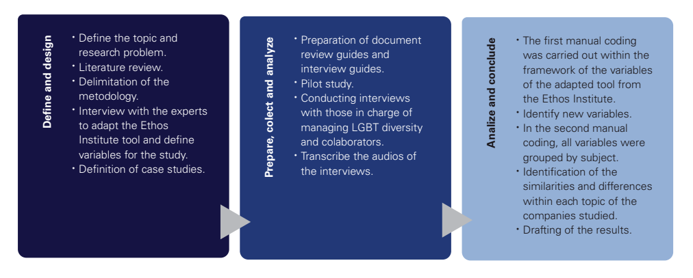
Figure 1. Methodology design