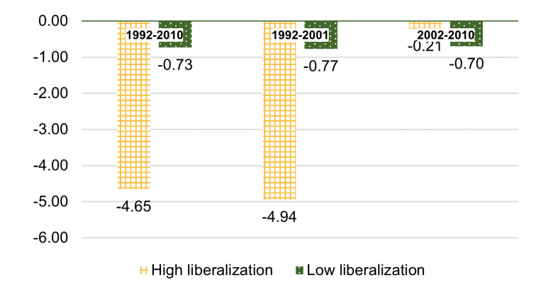
Figure 1. Average change in MFN tariffs for products with high and low preferential tariff reductions.

Figure 1 shows the average changes of MFN tariffs for high and low preferential liberalization. High preferential liberalization products are those for which the average preferential tariff reduction is greater than its median, in absolute value. For the entire sample, high liberalization products had their MFN tariffs reduced by -4.65 percentage points. This indicates that the products for which preferential tariffs were liberalized the most as a consequence of the CAN trade agreement, also had their external tariffs liberalized to a greater extent. When performing the same exercise for the first part of the sample we found similar results. However, for the last 10 years, high-liberalization products had their MFN tariffs reduced less than low-liberalization ones. Figure 2 shows the same exercise as Figure 1 for 1992–2001 and 2002–2010 by sector. It indicates that, for most sectors, during the first period products for which preferential tariffs were liberalized the most as a consequence of the CAN trade agreement also had their external tariffs liberalized to a greater extent; and that, for the last period, high-liberalization products had their MFN tariffs reduced less than low-liberalization products had their MFN tariffs reduced less than low-liberalization products