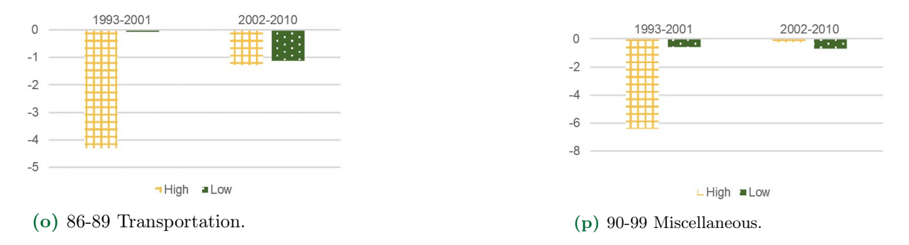
Figure 2. Average change in MFN tariffs for products with high and low preferential tariff reductions for 1992–2001 and 2002–2010, by sector.